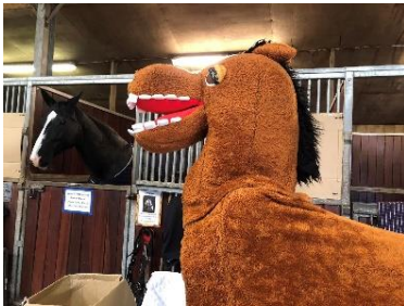
Athene's face says it all – a new kid on the block.

We marked Halloween with an afternoon to celebrate our volunteers, which of course meant there was some dressing up.